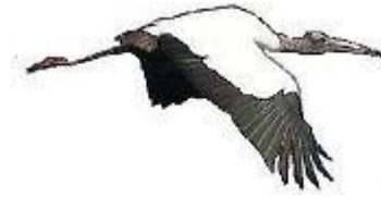
Wood Stork Mycteria americana

Birders should note this order differs from that of the currently accepted phylogenetic order found in the American Ornithologists' Union's Check-list.